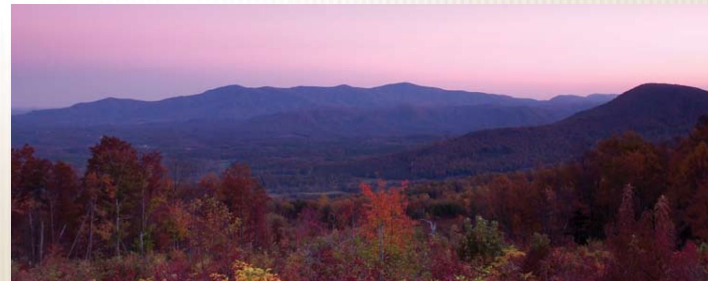
Autumn is a great time to visit Bright's Creek, but make reservations early.