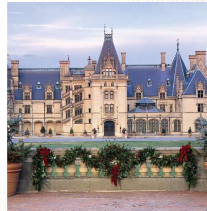
Christmas at Biltmore Estate.